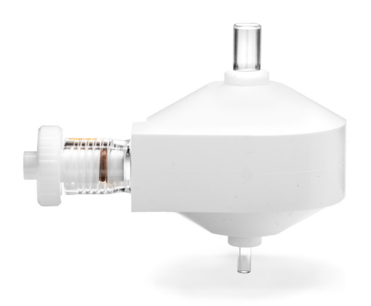
Figure 2. The removable glass double pass spray chamber is covered in a thermally conductive polymer layer that is easily cleaned.

For more information about our products and services, or to place an order, please consult your local Agilent office or supplier, or visit: www.agilent.com/chem