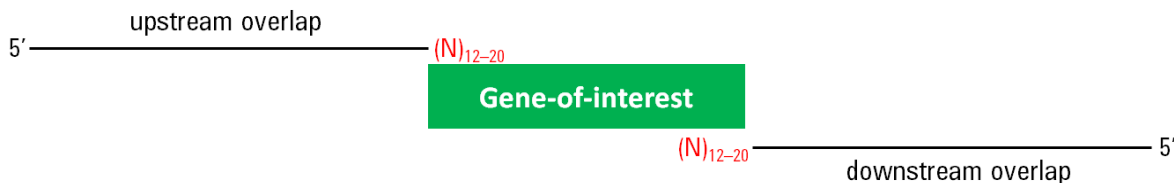
Figure 2 PCR method for adding overlap sequences to the 5' and 3' PCR primers