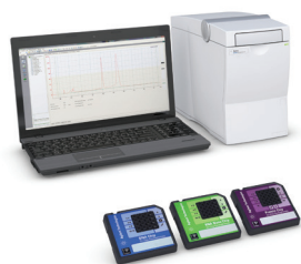
Agilent 2100 Bioanalyzer System

The Agilent 2100 Bioanalyzer System is an established automated electrophoresis tool for DNA and RNA quality control and ensures your sample is of the highest integrity in only 30-40 minutes.