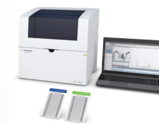
Agilent 4200 TapeStation System

The Agilent 4200 TapeStation system provides true end-to-end sample quality control within any next generation sequencing, microarray or qPCR workflow. The system offers walk away operation with fully automated sample processing. For the complete DNA and RNA assay portfolio, analyze 1-96 samples at a constant cost per sample. Ready-to-use ScreenTape technology enables ultimate flexibility for switching between assays in no time.