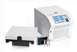
Agilent SureCycler 8800

The SureCycler 8800 Thermal Cycler provides users with a complete package of market leading features and functionality. This PCR machine can run even the most complex thermal cycling techniques including time and temperature increments, touchdown PCR, and temperature gradients.