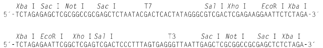
Figure 2 Multiple cloning site sequence of the Lambda FIX II replacement vector.