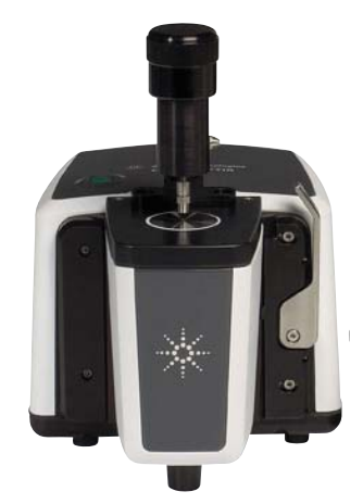
Figure 2. Agilent Cary 630 ATR-FTIR analyzer

Spectra were acquired in about 30 seconds by co-adding 64 spectra with a resolution of 4 cm-<sup>1.</sup> Each resulting spectrum was displayed on the computer screen along with its closest spectral analogue chosen from a spectral library database of sugar standards acquired using the Cary 630 ATR-FTIR analyzer and its MicroLab FTIR software.