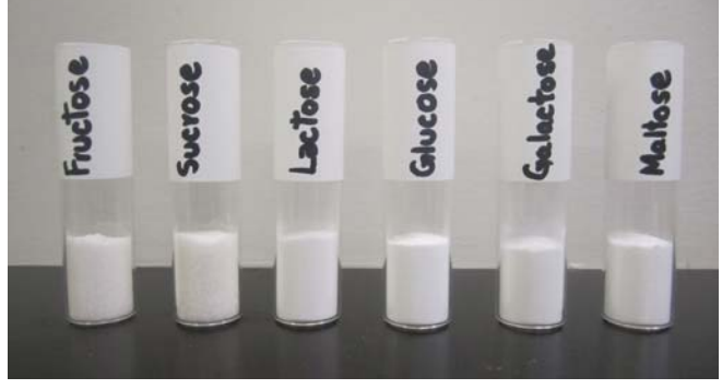
Figure 1. Various sugars

Currently, most pharmaceutical and food manufacturers rely on chromatographic techniques, which are tedious, time-consuming and require the use of solvents, to distinguish between the sugars. Occasionally, for quality assurance/quality control (QA/QC) purposes it is necessary to use internal or external chemical laboratory support for testing. As in all food commodity or food-grade pharmaceutical excipients, the manufacturer usually requires an advance sample from the supplier to verify that it meets their requirements. The sample is analyzed to compare it with other lots previously received. Then, when the bulk shipment arrives it must be tested to ensure that it has the same chemical and crystalline composition as the advance sample and that it is homogenous in composition. This can be accomplished by acquiring multiple samples from different containers. Sometimes, material from the regular supplier is not available and a new vendor must be found and the new sugar chemical composition must be compared to that supplied by the previous vendor.