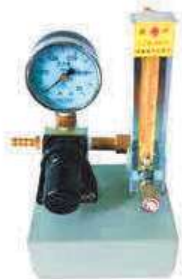
NDK-GV Gas Control Valve