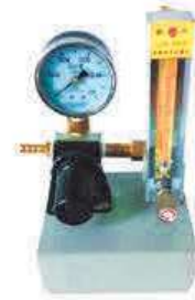
NDK-GV Gas Control Valve