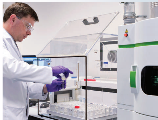
Atomic Emission Spectroscopy Analysis

With Honeywell's analytical reagents, superior quality and safety standards are a prime focus. We use a comprehensive Quality Assurance System in line with EN 29001 (ISO 9001) and each of our products is manufactured to clear, guaranteed specifications. We employ a large variety of modern analytical methods, such as inductively coupled plasma optical emission spectroscopy (ICP-OES), inductively coupled plasma mass spectrometry (ICP-MS), flame atomic absorption spectroscopy (AAS) and graphite furnace AAS (GF-AAS). This allows for specifically tailored control and analysis procedures for each product.