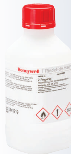
Honeywell Riedel de Haën - 2-Propanol TraceSELECT 04516-1L

The elemental response is usually independent of species, so it is often possible to quantify a species even when its structure is unknown (assuming good HPLC recovery). Identification, however, is based solely on retention time matching. Therefore, a compound in the sample can be identified only by comparison with a standard.