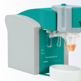
Multi-mode Electrode (MME)