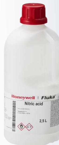
Honeywell Fluka - Nitric Acid TraceSELECT 84385-2.5L

For more information, visit: lab.honeywell.com/shop/applications/trace-analysis