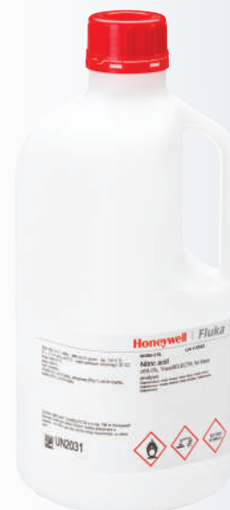
Honeywell Fluka - Nitric Acid TraceSELECT 84385-2.5L

The reduction of metals into mercury is more favourable than reduction to the solid-state electrode. Further on there is always a clean new Hg electrode surface available for each measurement.