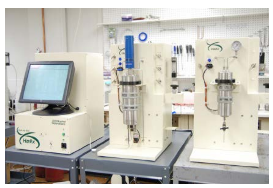
Basic Helix system with the separator module.