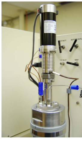
Vessel with Stirrer Assembly