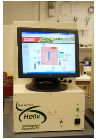
Touchpad System Control