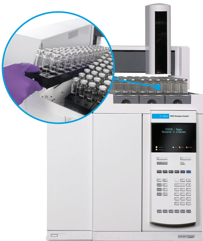
7697A Headspace Sampler 12/111-vial capacity