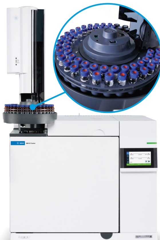
7650A ALS 50-vial capacity