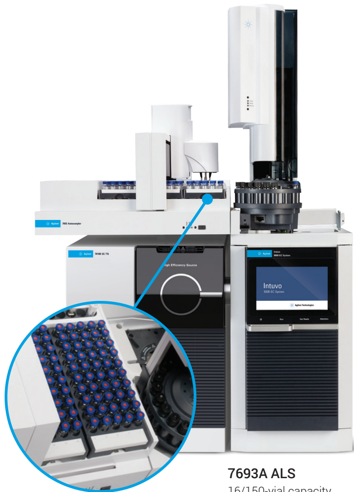
7693A ALS 16/150-vial capacity