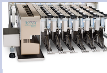
Bottles in ready-to-use position