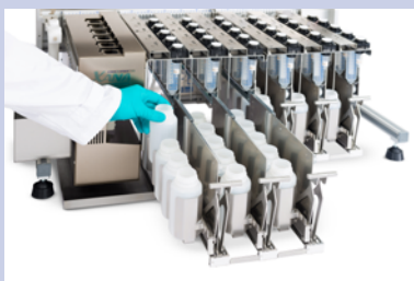
User friendly loading of bottle rack