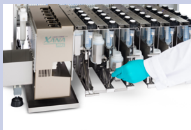
Easily lifted by hand